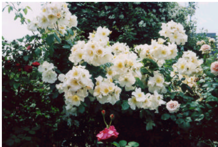
Roosevelt Island Rose Garden - “Sally Holmes”